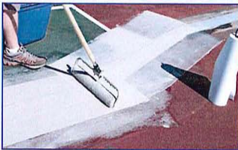
RiteWay Crack Repair System: Laying down micro sealant tape and stress mat.