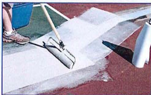
RiteWay Crack Repair System: Laying down micro sealant tape and stress mat.