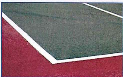
RiteWay Crack Repair System: Finished repair.

No Hollow-Sounding Areas. No Dead Spots. No Bubbling. A True Bounce. Guaranteed.