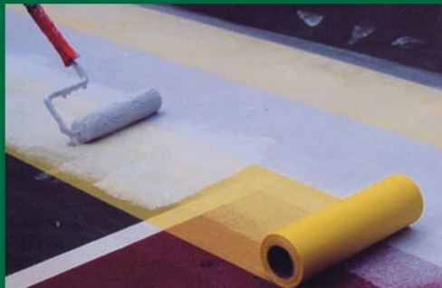
STEP 7: Install yellow ARMOR® mesh