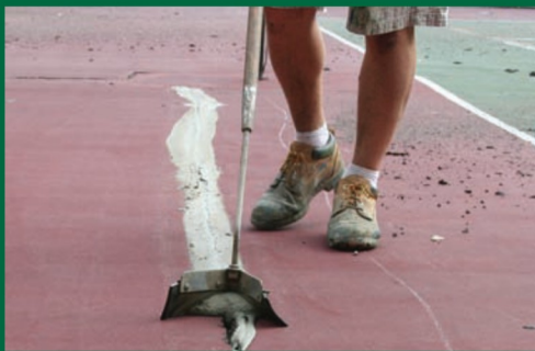
STEP 1: Fill cracks up to 4 inches wide