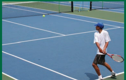
Crack-Free Surface...Ready for Play!

5050 Industrial Road Farmingdale, NJ 07727 © 2015 A.S.T.,LLC