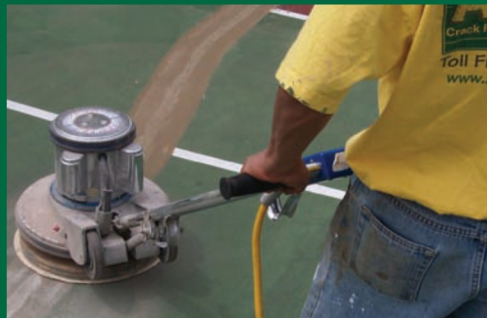
STEP 2: Sand flush to surface