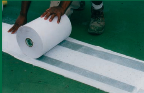
STEP 5: Install narrow ARMOR® fabric