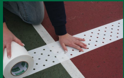
STEP 3: Apply ARMOR® release tape