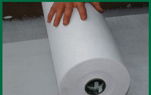
STEP 6: Install wide ARMOR® fabric