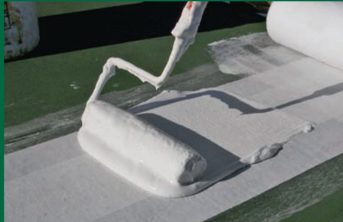
STEP 4: Apply liquid adhesive